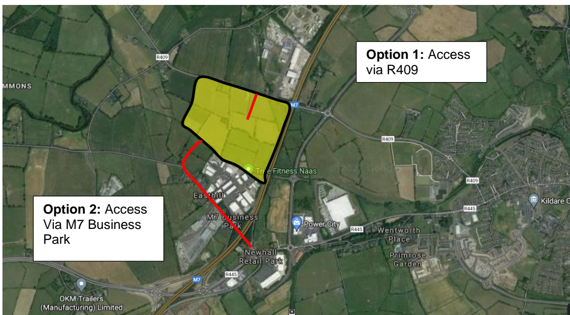
Figure 2: Location of Proposed Data Centre at R409 Caragh Road