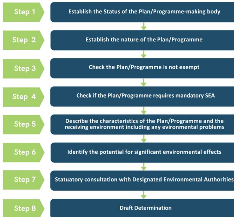
Figure 2-1: SEA Screening steps as per the EPA's Good Practice Guidance on SEA Screening